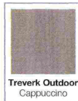
Treverk Outdoor Cappuccino